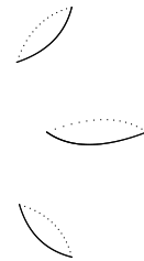
Singular Hitchin fiber in the B -model, {}^L G = SO_3 .

The fiber on the B -model side is a projective line with a double point, corresponding to a flat PGL_2 -bundle that is reduced to the subgroup O_2 . It is a \mathbb{Z}_2 -orbifold point of the moduli space. The dual fiber on the A -model side is the union of two projective lines connected at two points. These two singular points of the fiber are actually smooth points of the ambient moduli space.